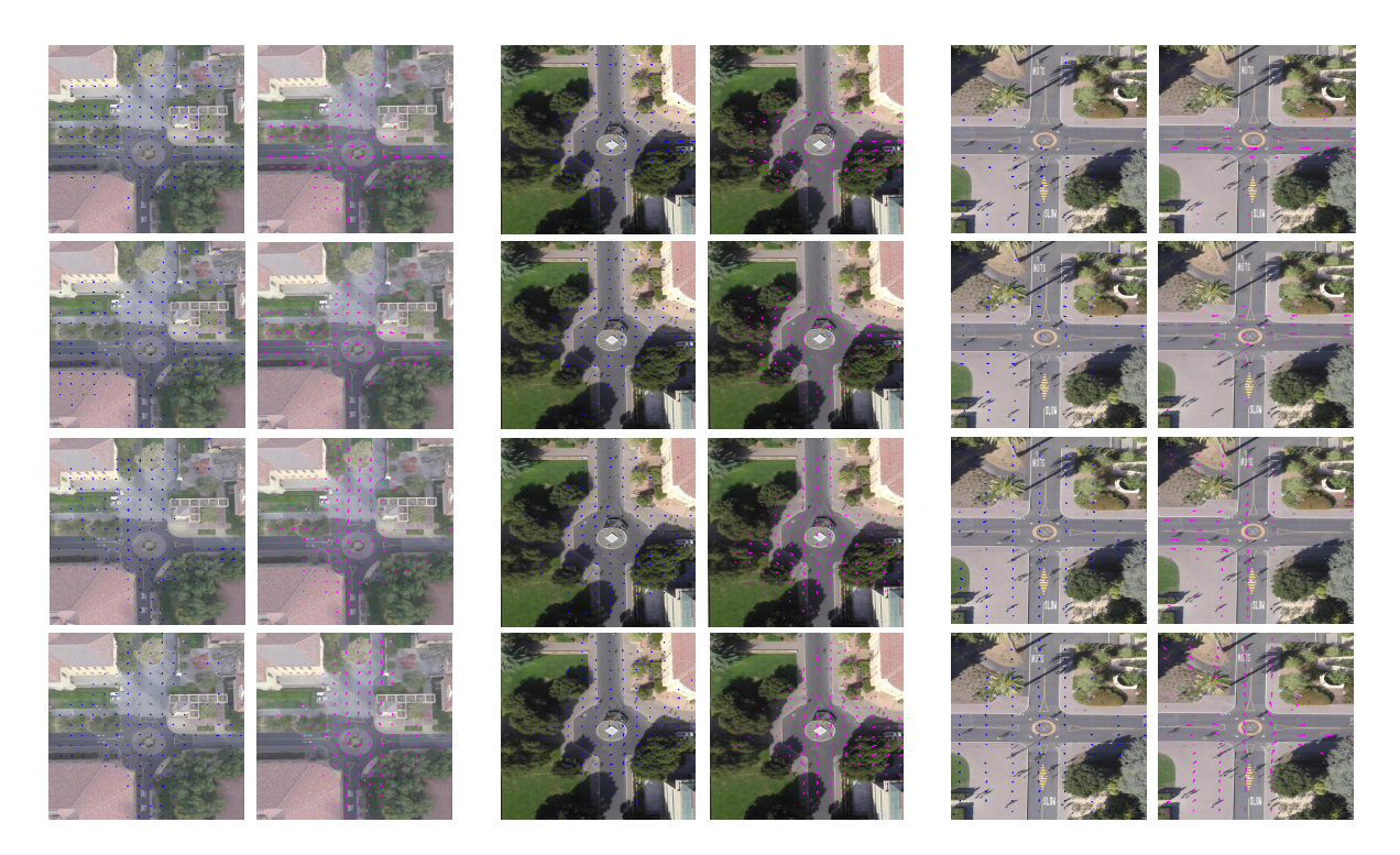
Fig. 3. Estimated motion fields (pedestrians in blue and bikers in magenta): Death-circle (left), Gates (mid), and Little (right).