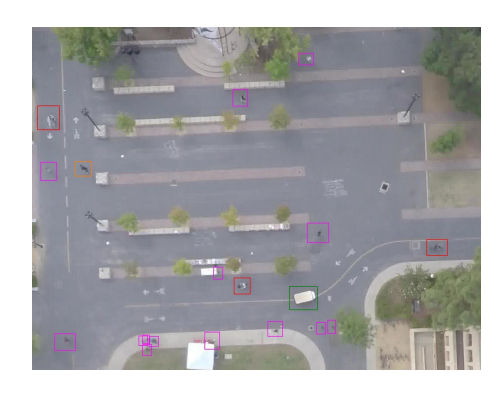
Fig. 1 . Image from the Stanford Drone Dataset [3]. The bounding box colors identify different agents.

Most of the works on the aforementioned topics focus solely on describing the behavior of one class of agent, usually pedestrians. Although this is a reasonable assumption in some scenarios (e.g, indoor sports), it will not be sufficient to describe complex and crowded scenes such as the recently released Stanford Drone Dataset [3], where there are several types of agents (bikers, skaters, cars, pedestrians) all interacting at the same time (see Fig. 1). Some works addressed the multi-agent problem considering that the pedestrians represent normal examples and that any other agent will be an abnormality [5, 6]. However, abnormality is a